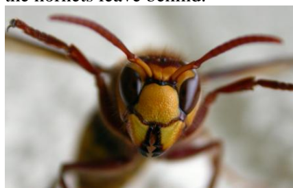
Hornet (by Ken Noble)

moth. The trap has also shown that hornets are active at night. Sometimes I am left trying to identify a moth from the wings that the hornets leave behind.