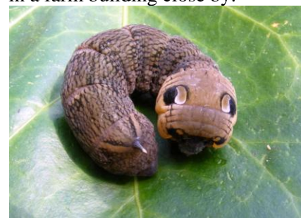
Elephant Hawkmoth Maggie Noble

Sometimes, luck presents you with a gift – as when a waxwing took a liking to my neighbour's garden. And at one point a barn owl roosted in a farm building close by.