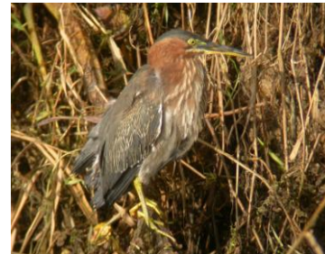
Little Green Heron – Ray Baker

Following on from the early arrival on 23 rd September of winter thrushes in our area the last quarter of 2008 produced some noteworthy sightings. Five stonechats were at Court Farm Warlingham on 9 th October, with a single fly over crossbill nearby the following day. Nearly 2 inches of snow fell and remained for a couple of days in our area at the end of the month; the first at this time since 1934!