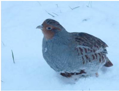
Grey Partridge in snow