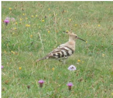
Hoopoe Farthing Downs

June 28th. Some butterflies did well however with silver-washed fritillary particularly numerous. I failed to see purple emperor or white letter hairstreak but others did in Woldingham. Returning waders on 27th July at Bough Beech included 10 green and 3 common sandpipers: there was also a peregrine and a single dunlin together with an immature black-necked grebe. The breeding little ringed plover hatched three young, but sadly only one escaped the crows and other predators. The first returning wheatear was on Nore Hill Chelsham on 15th August and swallows could be seen flying south. The banks of marjoram and thyme here were the finest display I've ever seen.