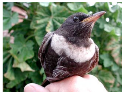
Ring ouzel

As I sit and write this milestone 50th edition at the beginning of October we are in the middle of an amazing heatwave that looks as though it could break all known records - who ever heard of 30°C at this time of the year! Not that our summer was anything to write home about but this reminds me how uncharacteristically hot it was back in mid April also, with temperatures of 27°C and bluebells almost past their best! Such weather encouraged the migrants to our area however, with 2 ring ouzels on 18th at Ashen Shaw Woldingham.